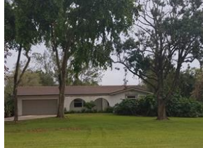
11060 SW 28th Ct

MLS#: H10331342 Status: A Price: $559,900 SqFt: 2,928 Beds: 4 Bath: 2 (2 0)