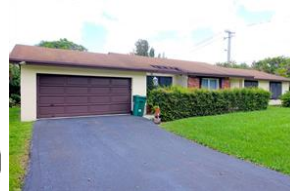
13001 SW 14th Pl

MLS#: A10346368 Status: A Price: $524,900 SqFt: 2,413 Beds: 3 Bath: 2 (2 0)